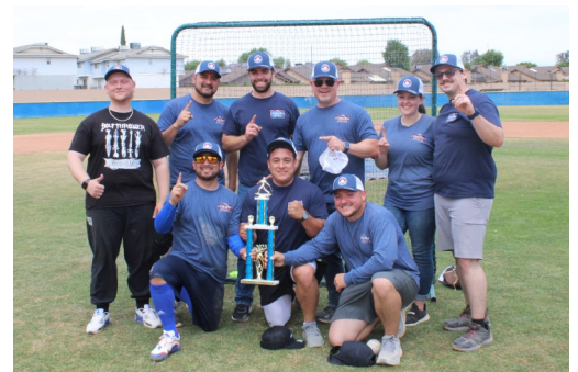
2025 Champions "The Can Do Crew"